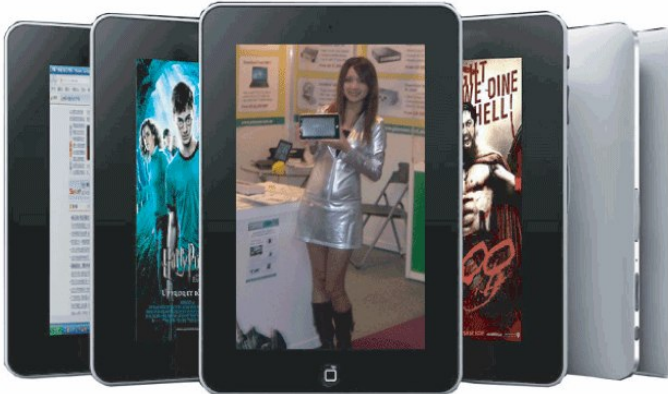
Launched in Computex 2010

Look no more... Pioneer Computers Australia has just released a new range of DreamBook ePad from 7" to 10" and starting from $199.00.