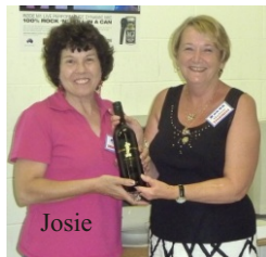
Last month's raffle winner.

For a small outlay of $1.00 per ticket or three tickets for $2.00 , members and guests have the chance of winning a bottle of wine as well as the opportunity to get rid of the loose coins weighing down and wearing out the lining of your pockets!