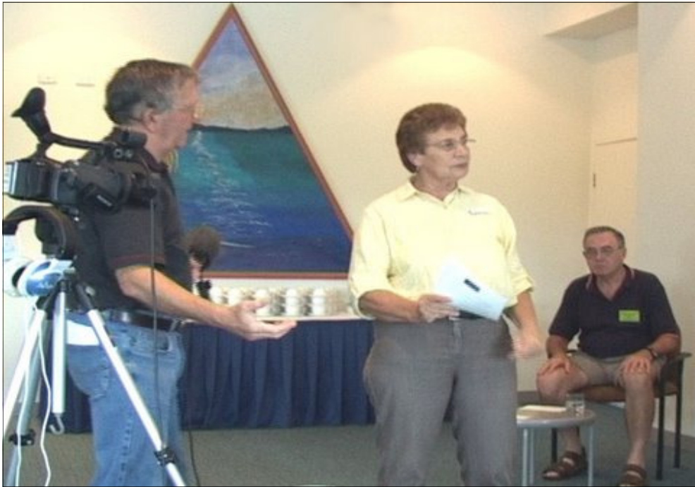
Action at the workshop