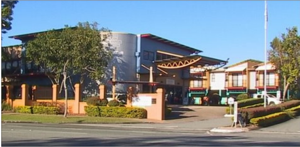
Australis Noosa Lakes Convention Centre