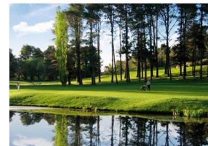
Yowani Country Club