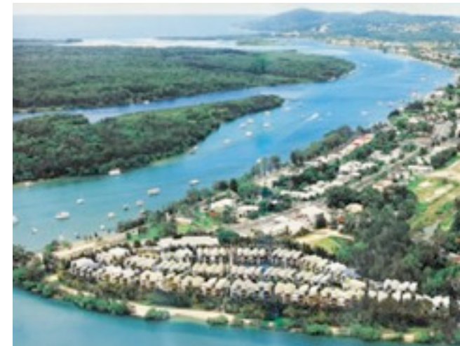
SUNSHINE COAST - NOOSA AREA